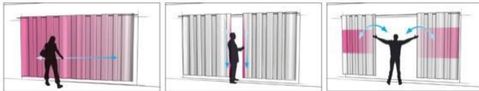
Figure 1: Possible ways of interacting with an augmented curtain. The gestures on the left and on the right are taken from traditional curtains, whereas the middle one relates more to vertical persian blinds. In this paper, we built on the interaction on the right.

The interaction is designed similarly to how you would draw a curtain open in the morning, with a large swipe from the center to the outside (see Figure 1). As motorized curtains are usually installed on large windows, the user cannot cover the entire surface of the curtain with one gesture. Furthermore, it should be possible to open the curtain at different granularities. We designed a sensing pattern that allows both coarse and fine input.